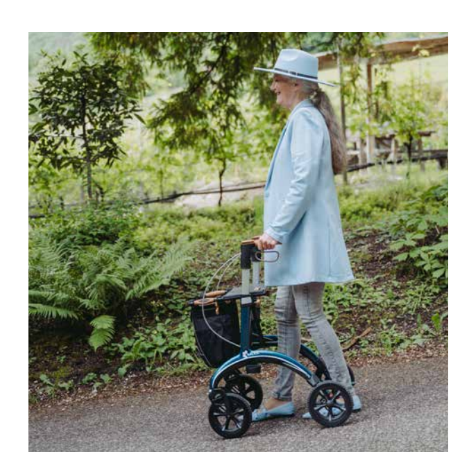
Built-in safety: grinding brake for better control when going downhill or when more support is needed

Safety and control while walking are your top priorities? The grinding brake on the CR provides exactly that. The rolling resistance of the rear wheels can be individually adjusted, gently braking without locking (ABS), and preventing your rollator from rolling faster than you want – especially helpful on slopes. The brake supports you optimally in cases of walking instability, can counteract incorrect directional drift, and thus reduces the risk of falling. Once properly adjusted, you can activate or deactivate it with your foot.