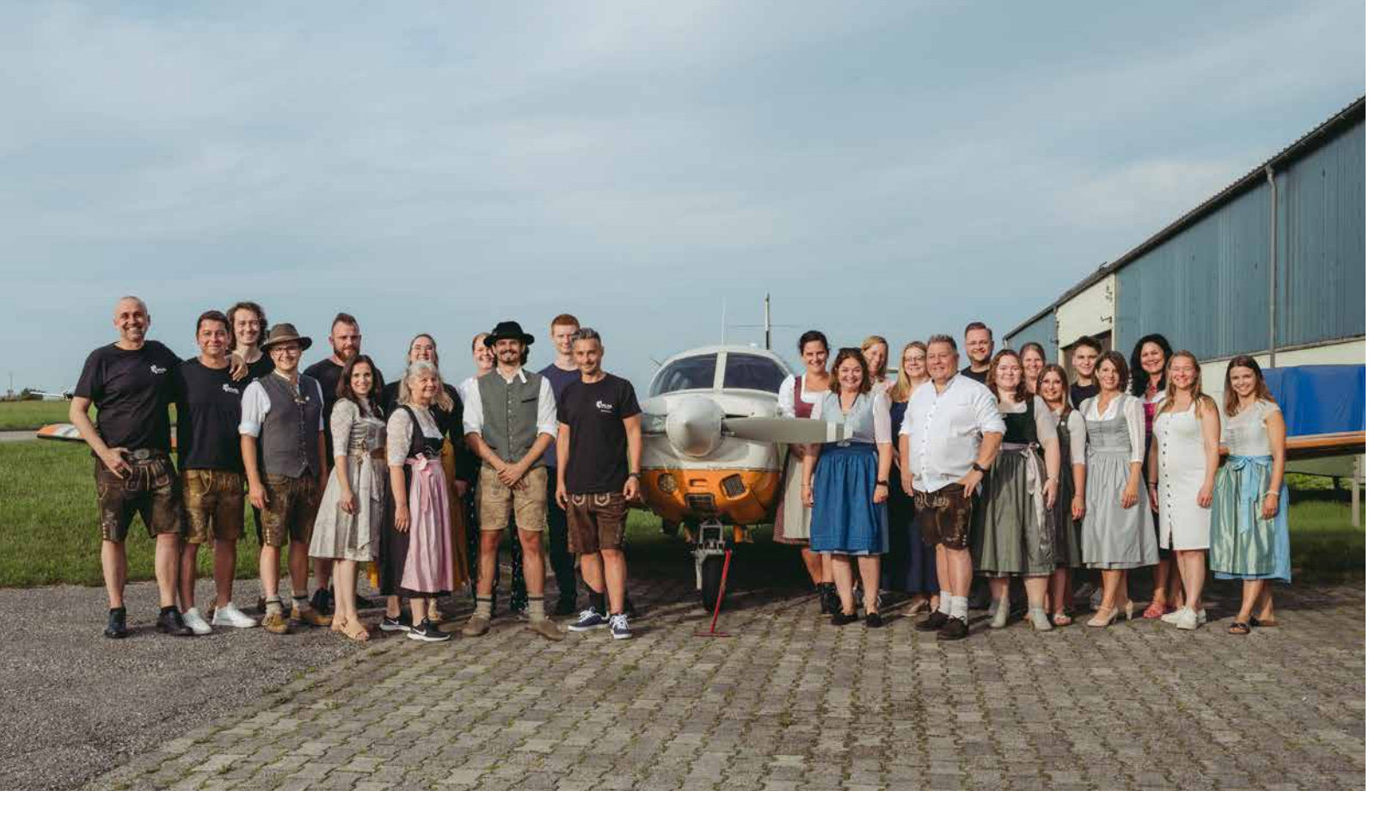
German Engineering from Bavaria